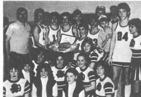
TEAM EFFORT — The Buffalo, N.Y., YOU basketball team celebrates with cheerleaders after winning the Division I title in the YOU district tournament in Buffalo March 13 and 14. Photo at right shows Division II game between Buffalo and Erie, Pa. (See "Youth Activities," this page.)