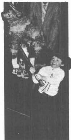
MIGHTY SWING — A youth tries to break open a pinata at a combined social of the St. Catharines and Hamilton, Ont., churches Feb. 13. (See "Church Activities," this page.)

A YOU district family weekend took place in BUFFALO, N.Y., March 13 and 14. More than 210 brethren from (See CHURCH NEWS, page 7)