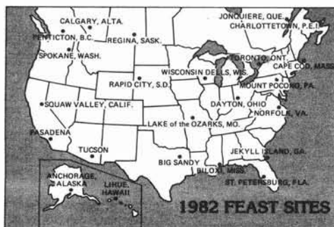
FESTIVAL SITES — Pictured above are the 1982 United States and Canadian Feast of Tabernacles sites approved by Pastor General Herbert W. Armstrong. A list of sites worldwide appears on pages 7 and 8.

Instructions for making your housing arrangements are included in this issue of The Worldwide News .