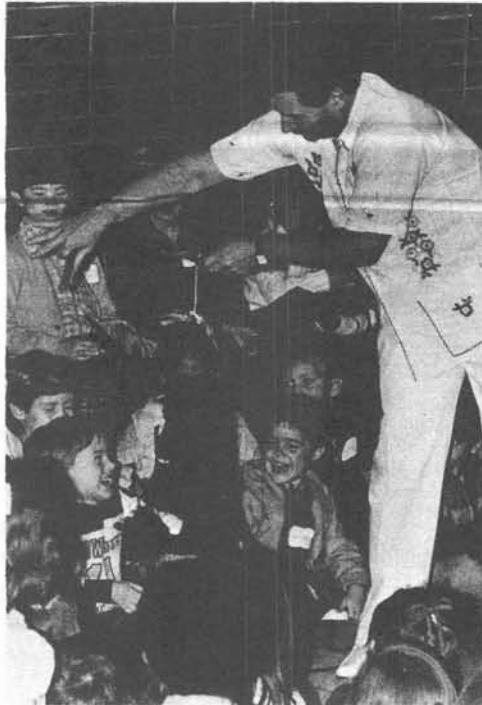
MARIONETTE SHOW — Children from the four Pasadena church congregations enjoy a marionette show March 28 at a party played host to by the Pasadena Senior Girls' Club. (See "Youth Activities," page 7.)

A monthly Bible study was conducted in WENTZVILLE, Mo., March 16 at