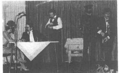
COMEDY SKETCH — Members perform a Charlie Chaplin routine at the Brisbane, Australia, variety concert March 1. (See "Church Activities," this page.)