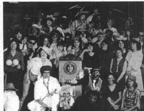
COSTUME DANCE — Members of the Fresno and Visalia, Calif., YOU pose at their costume dance Feb. 23. (See "Youth Activities," this page.)