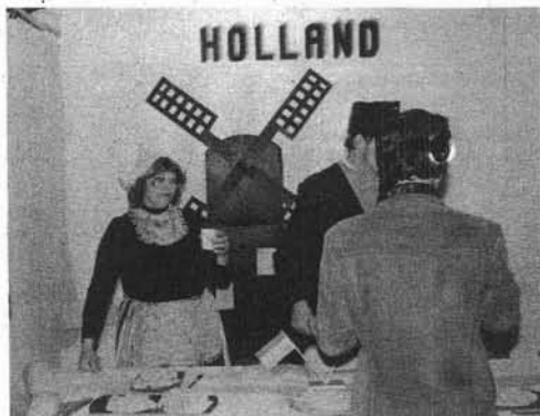
INTERNATIONAL NIGHT — The Toronto, Ont., church social was a globe-trotter's paradise March 1. Booths were decorated to represent 10 countries. (See "Church Activities," this page.)