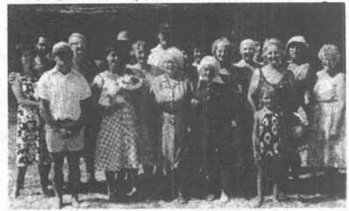
TWENTIETH ANNIVERSARY — Adults who have been Church members for two decades pose at the Sydney, Australia, commemoration of 20 years of the Church in that country Feb. 24. (See "Church Activities," page 7.)