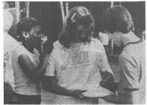
COLLECTING AUTOGRAPHS — A camper collects autographs on her camp shirt at the end of last year's Summer Educational Program at Orr, Minn.

Applications and other correspondence should be mailed to: YOU Summer Educational Program, 300 W. Green St., Pasadena, Calif., 91123. The department's telephone number is (213) 577-5720.