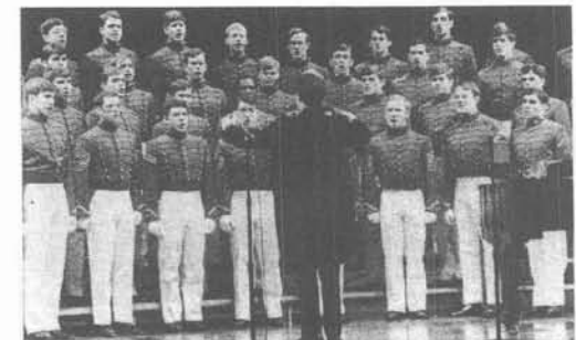
SINGING SOLDIERS — Members of the West Point Glee Club from the United States Military Academy perform in the Ambassador Auditorium. The March 19 performance was part of their West Coast tour, during which time the cadets were the guests of Ambassador College.