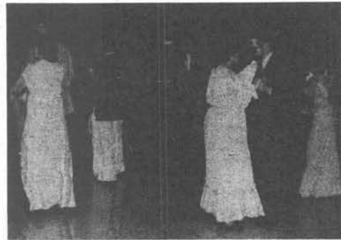
SEMIFORMAL DANCE — Members of the Birmingham, Ala., church participate in the annual semiformal dance Feb. 17. (See "Church Activities," this page.)