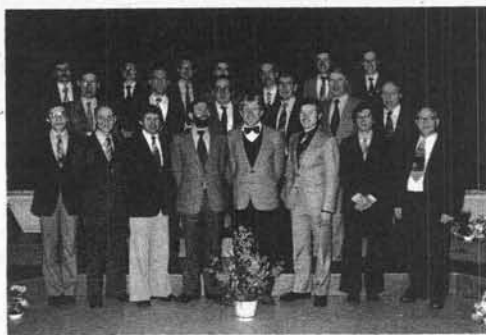
SPEAKERS POSE — The Tilburg, Netherlands, Spokesman Club pose for a group photo at their ladies' night Feb. 10. (See "Club Activities," this page.)