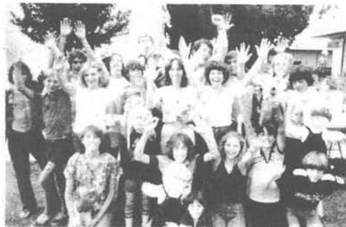
CARNIVAL FUN — Glendale, Calif., YOU members show off some of their prizes at their carnival at the former Imperial High School gymnasium in Pasadena Sept. 16. (See "Youth Activities," page 10.)