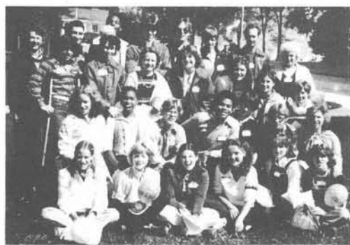
FRIENDSHIP FAIR — A group of YOU members from the Rochester, N.Y., church participate in the Newark Developmental Center's Friendship Fair Sept. 9, escorting wheelchair-bound residents to the fair's activities. (See "Youth Activities," this page.)

The singles clubs in the CHICAGO, Ill. , area camped out Labor Day week-