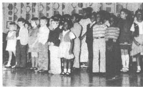
YES SINGERS — YES students of the Richmond, Va., church sing "Self-Control" at services Sept. 15, their last meeting before the Feast. (See "Youth Activities," this page.)