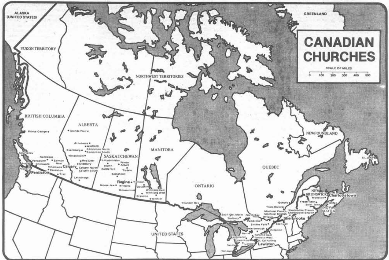
CANADIAN CHURCHES — Indicated on the map above are all the churches in Canada. The church locations reflect the population density of the country, which is heavily concen-