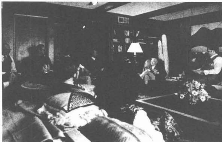
FACULTY IN TUCSON —Members of the Ambassador College faculty listen May 17 to Herbert W. Armstrong in his Tucson, Ariz., home discuss the ways to continually improve the approaches of courses taught at the college.

"It is very encouraging to note," he wrote, "That . . . all of us felt stronger than before to stand resolutely and unwaveringly behind God's apostle for the end-time Work, despite our physical insufficiency and poverty."