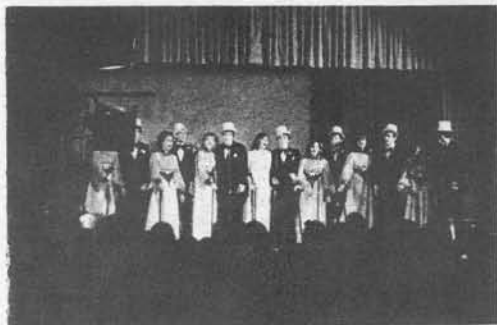
ENTERTAINMENT — A group of Ambassador College students, the Young Ambassadors, perform at the college's 1979 Graduation Ball May 13.