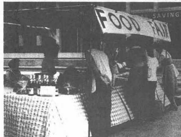
FOOD FAIR — Members of the Ambassador Cultural Alliance, a women's club of the Pasadena churches, sell baked goods at a food stand at a Pasadena outdoor art sale May 18. Results from the sales were donated to the Church.