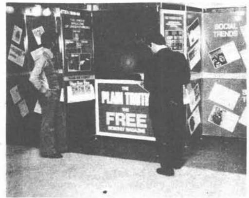
BRITISH EXHIBIT — Color displays of The Plain Truth magazine line the walls of an audiovisual display cabinet in the United Kingdom and show the content and history of "The Unique Magazine of Understanding."