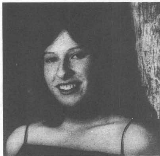
heroine in a western spoof produced by the Melbourne Film Club.