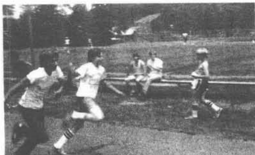
DAY AT THE RACES — Track and field competitors vie for top positions in a YOU district meet in Scotch Plains, N.J. (See "Boa Constrictor," this page.)