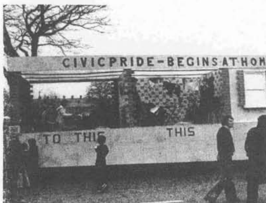
THE DIFFERENCE — This float, constructed by members of the Belfast, Northern Ireland, church, shows the difference between an unhappy home and a happy one. Free Plain Truth magazines were available from a rack mounted on the float.