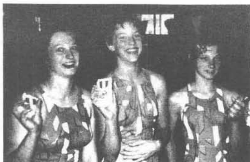
SWIM AND DIVING MEET — YOU regional winners flash their medals at the conclusion of a regional swimming and diving meet in Amarillo, Tex. (See "$100 Jackpot," this page.)