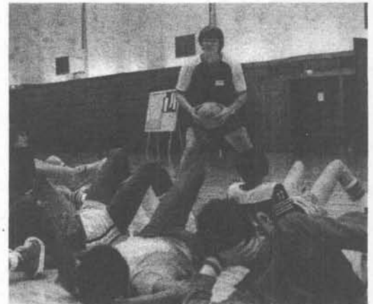
HUSTLE — Campers learn some fundamental skills from their coach in a morning session.