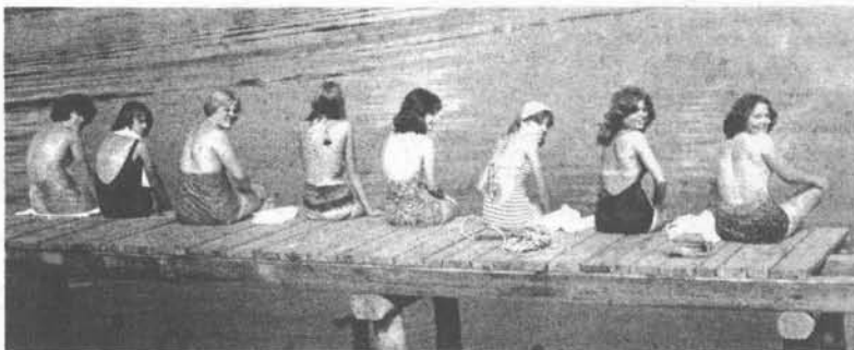
HERE'S LOOKING AT YOU — SEP campers in Orr, Minn., say hello. The first camp session ends July 5 and the second begins July 19, with more than 300 campers signed up for each session. Beginning July 10 Bill Sharman, general manager of the Los Angeles Lakers basketball team, will conduct a five-day basketball clinic on the Orr campus for YOU boys in the northern United States.

With much love in Jesus' name, Garner Ted Armstrong