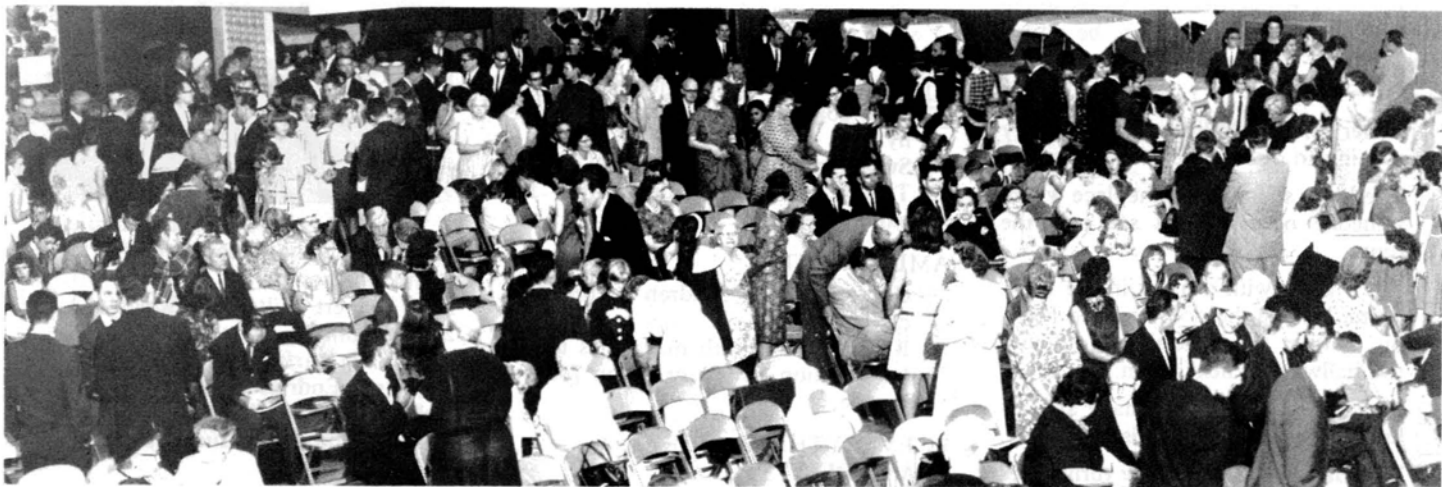
Keyman's Club host to largest weekly Bible Study held in Chicago.

Mr. Waterhouse explained how this re-development of existing buildings and lands fit in with God's overall plan. In the millenium, Israel will first be required to rebuild the devastated areas of the world before going into a full-scale building plan. It was wonderful to see how virtually useless and wasted areas were brought under control and developed to their full beauty as God intended.