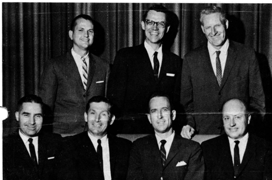
NEW SPOKESMAN CLUB OFFICERS—CHICAGO AREA