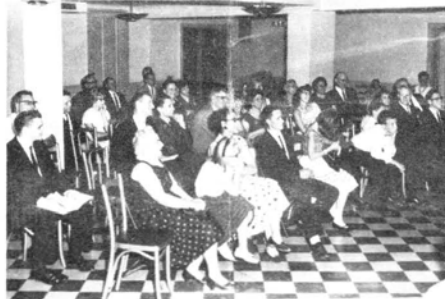
The Guest section at the recent Saturday night Spokesman Club Auction Night typifies the many Church functions in which brethren came out to take an active part. Many had much more fun just watching than bidding.

This auction was only one of the many activities sponsored by the Spokesman Clubs lately. We eagerly look forward to more fun-filled, exciting activities such as these. Why don't you join us?