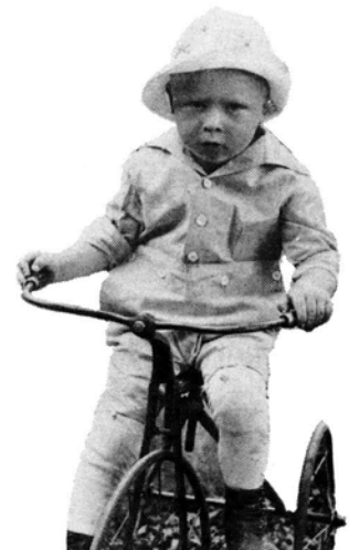
A certain Deacon aged four—guess who! Note those fancy wheels! See next issue.

At the present time there are about one-hundred-eighty in Sabbath attendance at Grand Rapids. This is a foundation upon which God can build a larger church after stability has been achieved.