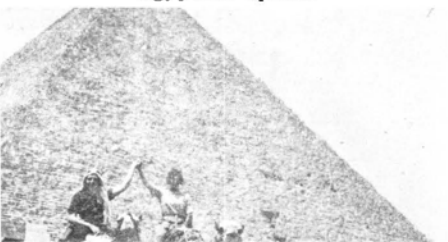
Pyramid, Giza, Egypt, Evangelist Blackwell and wife, mounted on camels, foreground.