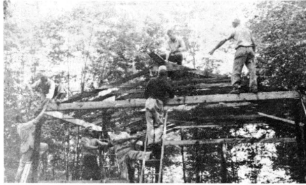
Elkhart-Grand Rapids members discuss knotty construction problem.

The two Elkhart Spokesman Clubs (sponsors), went "ALL-OUT" to make the occasion a gainful one—beginning with a "Camp-OUT" Saturday night, followed Sunday by a "Cook-OUT", a "Work-OUT", and a "Speak-OUT" (evening Spokesman's meeting). P.S. No "Drop-OUTS", but many lads of all ages reported home "Played-OUT"!