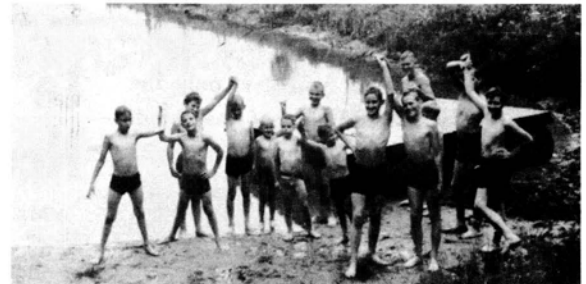
Meanwhile, boys are assigned in a "buddy system" prior to swimming.

Holland site to various points about the state, Grand Rapids included. Their "stamp" was imprinted upon every city they entered. They would go to their church two or three times on Sunday. This was indeed a pious people, believing they were God's elect and all others were lost.