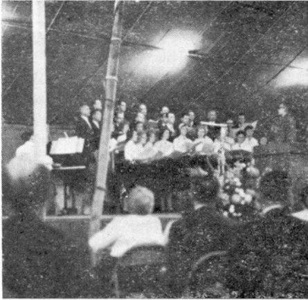
Combined Chicago-La Grange Chorale singing praises to God under The Big Tent.