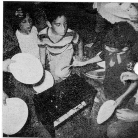
LOCUST EATERS at Boys Camping Trip

Thirty-two in all - something for which we can all be joyful, remembering that we, too, were once babes and, as many of us know, stumbling and tripping while trying to learn God's ways because of our own carnal natures. But, rejoice, my brethren, for with God's Holy Spirit we can do all things.