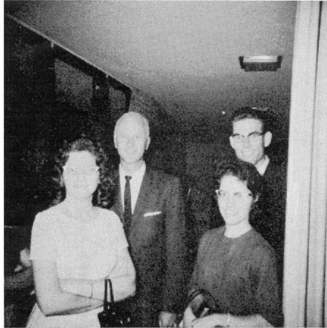
HOLIDAY INN, TYLER

Every day at the Feast brought about new things to do, different types of entertainment and interesting tours. We were entertained at each meeting with special music by either the Pasadena Chorale, New York Chorale, Chicago Chorale or Glade-water High School Chorale. Planned recreation such as roller skating, bowling and vimming was enjoyed by the younger members and by many of the adults. Many of us also indulged in fishing, boating and water skiing.