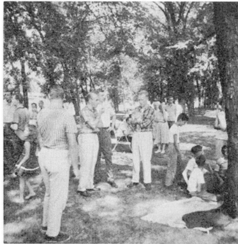
NORTH AURORA PARK

All who came spent a joyful day playing together and can look forward to another picnic next year.