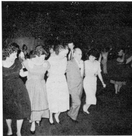
One of the recent, very successful Chicago Socials