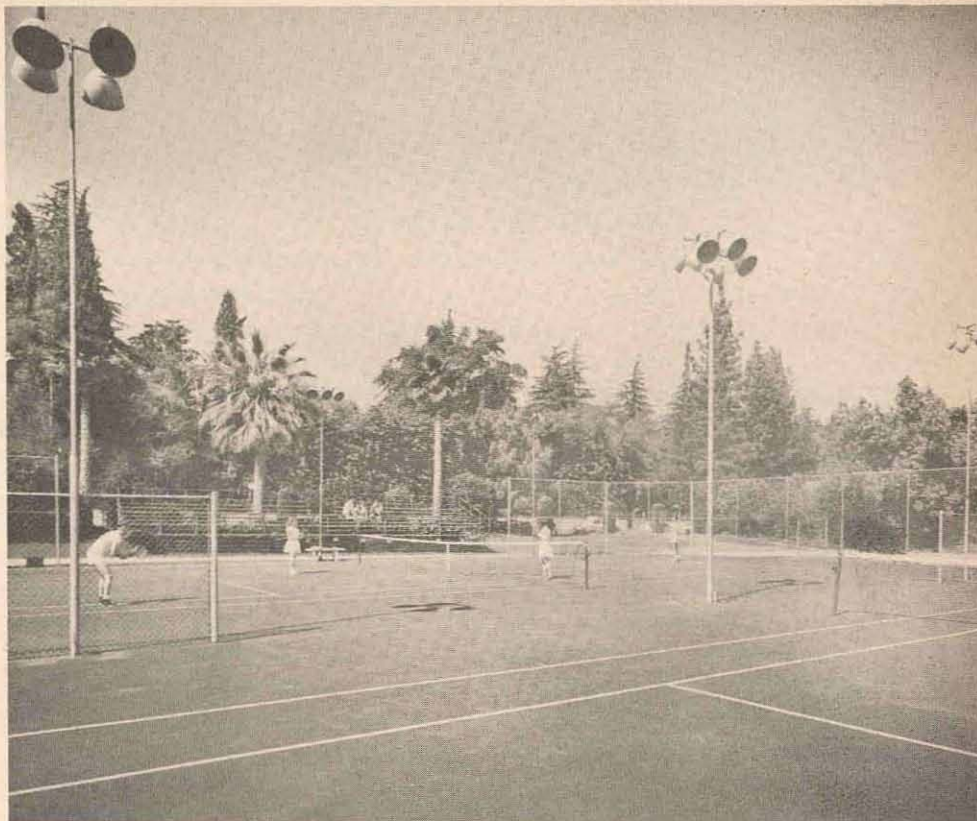
Tennis courts provide ample opportunity for physical exercise and social entertainment for Ambassador students.

Today "modern science," especially through biology, psychiatry, medicine and other so-called sciences, aided and abetted by the moral toboggan-slide, has swung the public attitude and the practise among juveniles to the opposite extreme. Today TIME magazine reports a "New Religion" in Europe from Paris—a religion of "emancipation" for women—a "religion" of unbridled immorality. Today a London newspaper in two feature articles exposes the "new freedom" in Sweden. A mother is quoted as saying she finally became a little dissatisfied finding a strange girl frequently in her kitchen in a bathrobe on arising of a morning; and, since her 20-year-old