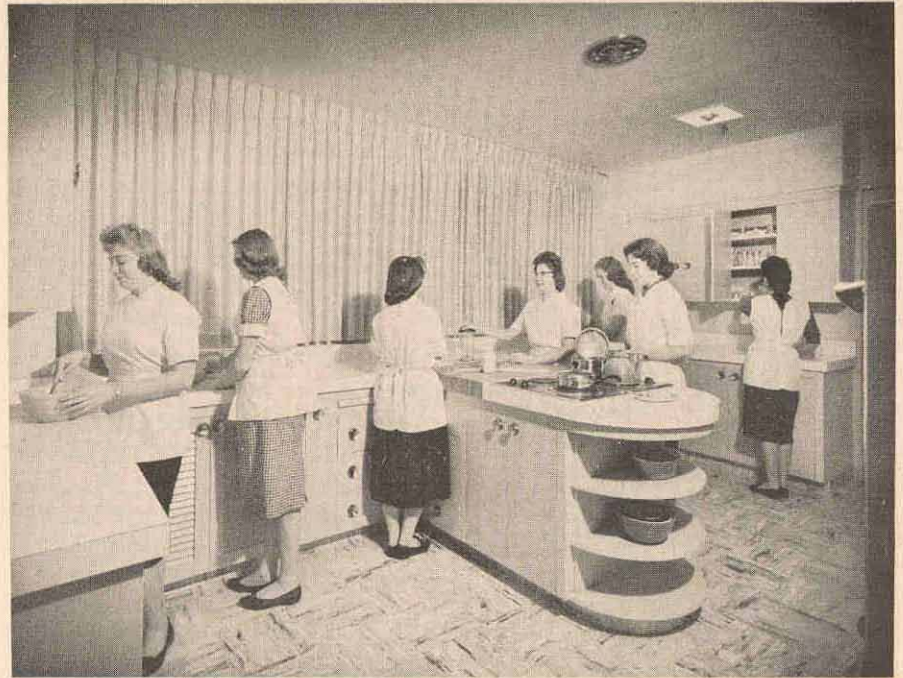
The Home Economics Department at Ambassador College, Pasadena, California, provides young women with ample facilities and training.

The Academy founded by Plato, some 350 years before Christ, gave instruction to men only. The pagan schools that dotted the Roman Empire in the first centuries after Christ were for men only. The Cathedral and the Monastic schools which replaced them after the 6th century admitted no women. The first universities at Salerno and Paris were attended only by men. When Oxford, Cambridge, Harvard, Yale and Columbia first were formed—and for some