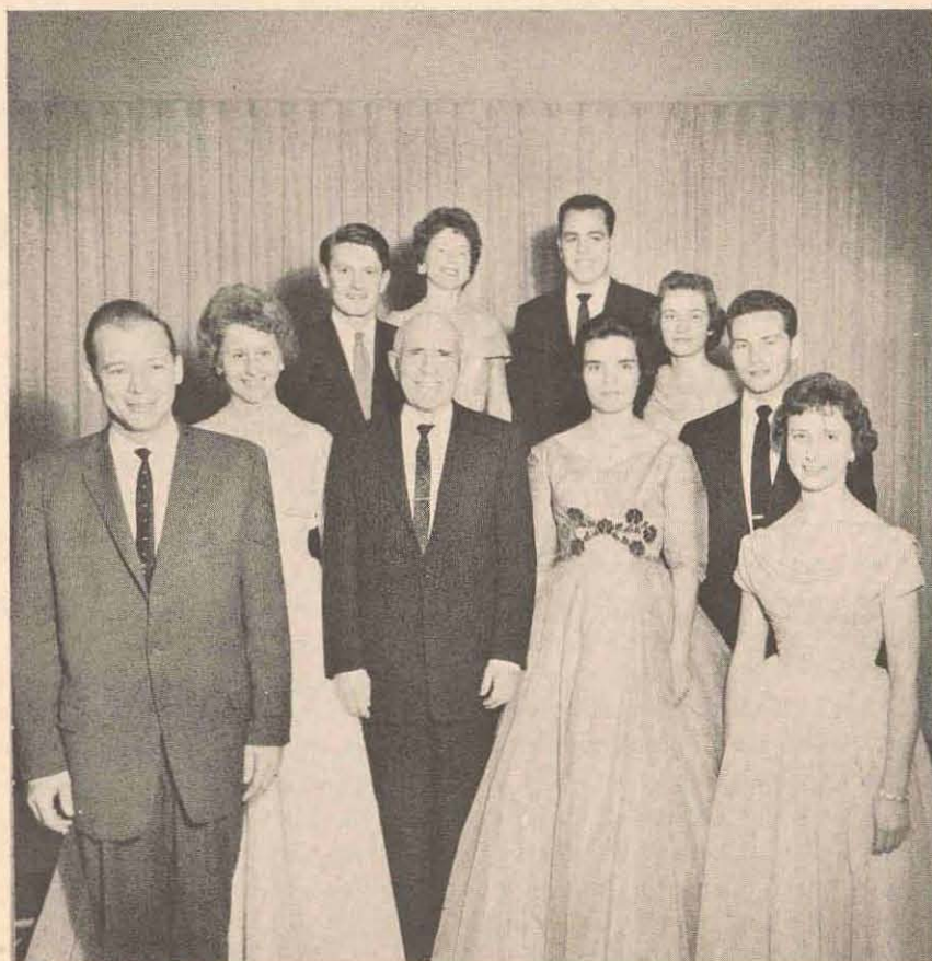
The Ambassador Octet provides cultural training for both young men and women.