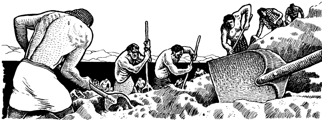
The Egyptians feverishly dug into the river banks in search of springs of clear water.

In spite of all the misery in the land, Pharaoh stubbornly refused to change his mind about the Israelites. However, as the week went on, he began to wonder if the discomfort of his people was too high a price to pay to keep the Israelites as slaves. At the same time Pharaoh and those about him were not as miserable as most other people, because every effort was made to supply clear water to the royal family. But Pharaoh knew that the nation couldn't last long under those conditions. He realized that sooner or later he would have to give in and call for Moses and Aaron.