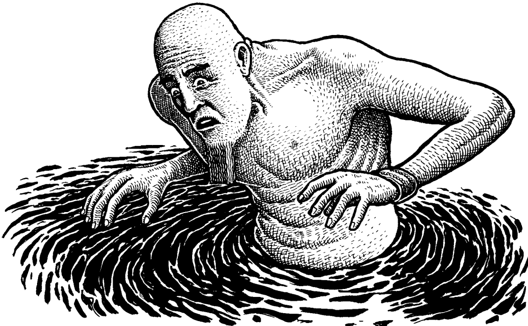
The King stared down at the water; it was turning red!

It was difficult for Pharaoh to regain his dignity and calmness. But he knew he must do so before his servants. Furthermore, he felt that he had to prove that the two Israelites