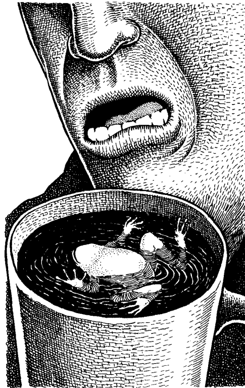
Another frog was floating lifelessly on its back in a silver cup of Pharaoh's favorite beverage.

Pharaoh's gaze dropped to the floor. He leaned forward and blinked. The frogs the magicians had brought on had disappeared!