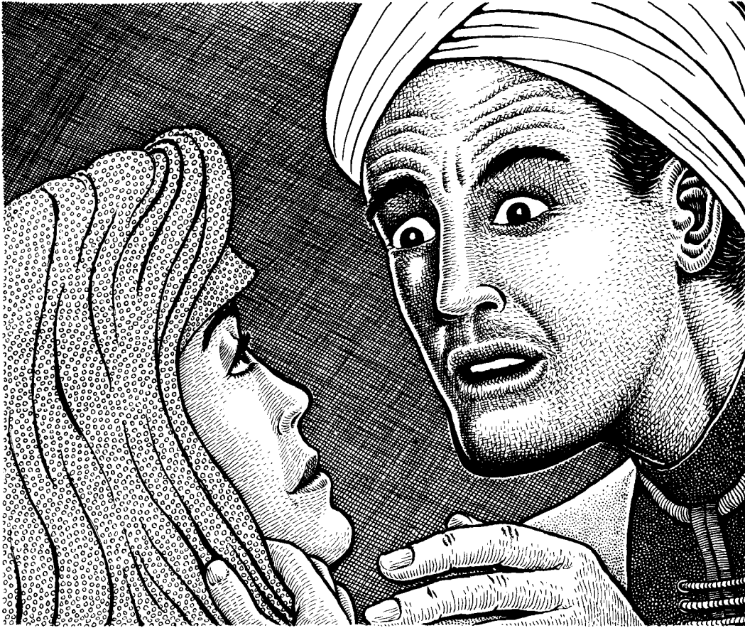
The bride drew back her heavy veil, and Jacob was amazed to see that he had married Leah—not Rachel!

When the seven years had passed, Jacob reminded Laban that it was time for the marriage. Laban gave a great marriage feast that lasted a whole week. Many people were invited, and it was a time of much celebration.