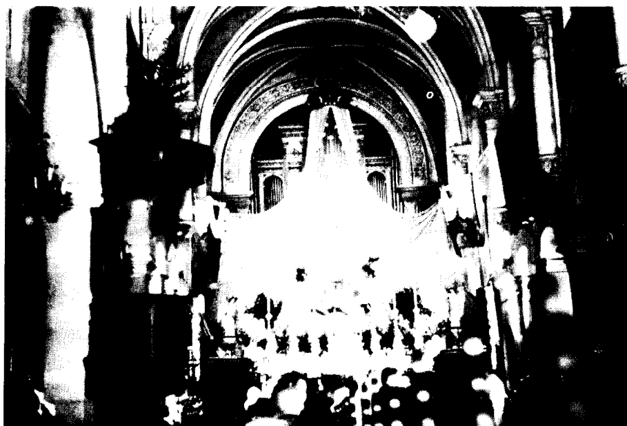
The gorgeous altar of a Palestinian Catholic Church. The Church is dedicated to Mary, who is mistakenly called "Queen of Heaven."