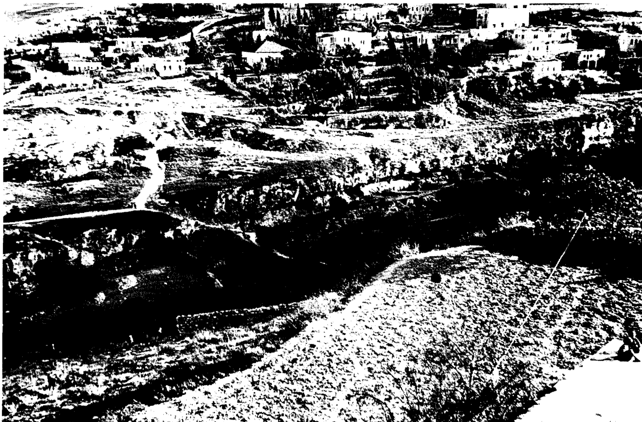
Here is a picture of "HELL." The valley of Hinnon, or "gehenna," translated "hell" in many versions, is viewed from outside the walls of Jerusalem. Into this valley criminals and garbage were dumped to be consumed by the fires that burned in the bottom. Worms consumed waste that fell on the ledges. The fires of this valley are again to be ignited and the wicked are to be cast into it and perish forever.

the two churches, or the Priests of the two, get into real fights some times. Each church has out its money boxes and each watches the other in jealousy.