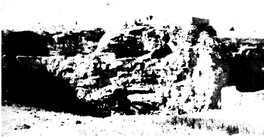
The rock above is called "Golgotha" in the Hebrew. It means "The Place of the Skull." Jesus was crucified atop this rock. Notice the natural caves forming the eyes and mouth.

From this place can be seen "The Place of the Skull." No one can fail to see the resemblance. There is a low eroded forehead, two deep hollows that make the eyes, a nose, and near the ground level, twisted lips.