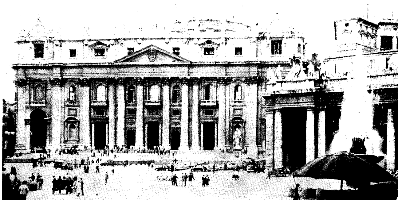
The world-famous St. Peter's Cathedral in the Vatican. Part of the Pope's Palace may be seen in the upper right corner. Note the immense statues atop the walls—compared with the visitors below.

After seeing Naples, we drove to the ruined city of Pompeii. This was the most startling place we have seen. In the year 79 A.D., Pompeii was completely covered with ashes from Mt. Vesuvius. It was a city of twenty-thousand people. While thousands escaped from the city to the sea, hundreds perished in their homes and in the streets.