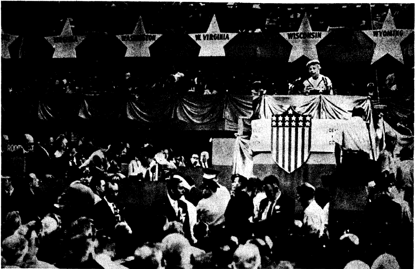
Mrs. Roosevelt addresses the Democratic Convention at Chicago.