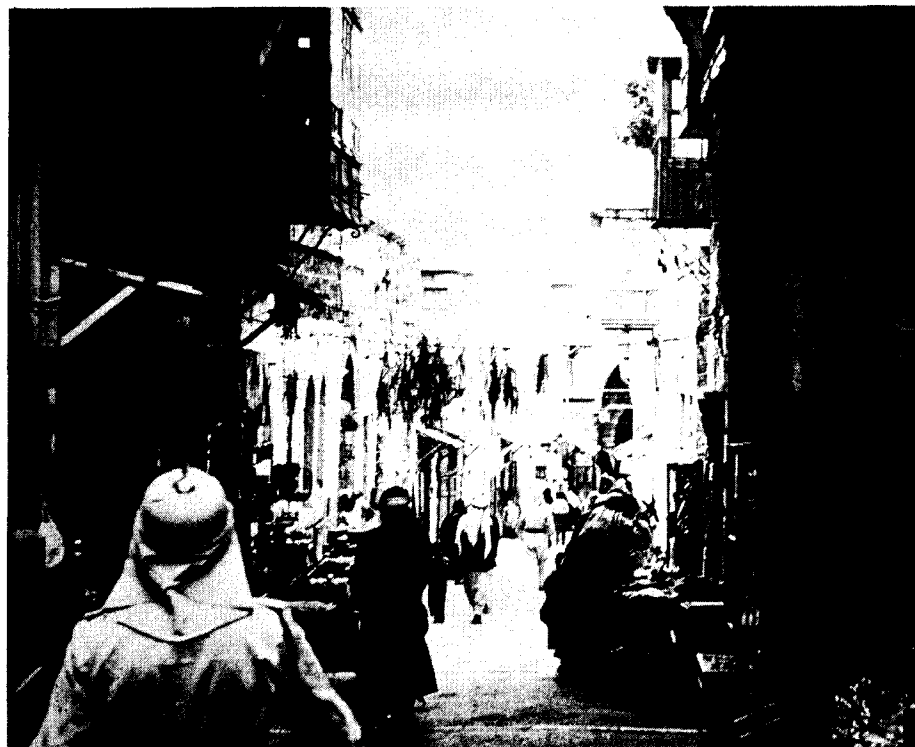
A typical street scene in the Arab Section of Old Jerusalem.

After leaving the mosque we were taken to the market, or Bazar (as they are called there). There were narrow, dirty streets packed with dirty people—all Arabs in dirty robes. There were open shops on both sides of the streets. A number of times in the crowd we were