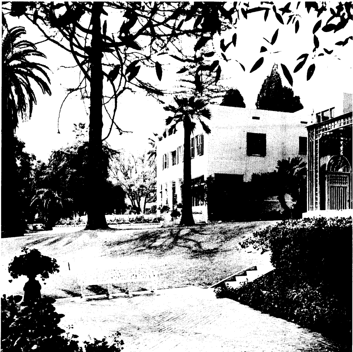
One of four patios on our picturesque AMBASSADOR COLLEGE campus