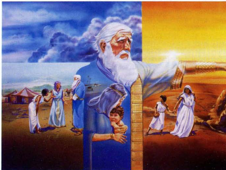
Scenes from Abraham's life. Abraham fathered Ishmael by Sarah's handmaid Hagar, only to eventually banish both boy and mother. Abraham proved his friendship with God when he was willing to sacrifice Isaac, his only son by Sarah.