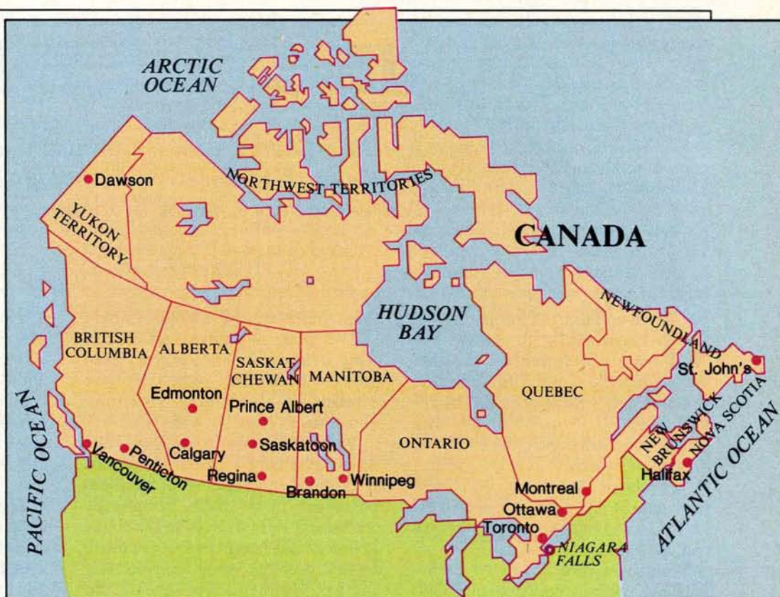
Canada has felt the Work's impact since the 1930s, when Herbert W. Armstrong could be heard on U.S. West Coast radio stations. Today Canada has 69 regular Church services and 28 outlying Bible studies.

A 1 percent yield has virtually doubled the circulation of The Plain Truth over a two-month period this year. The insert has appeared in German and French as well as