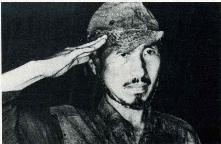
HIROO ONODA, A SECOND LIEUTENANT in Japan's Imperial Army during World War II, was determined to do his job, no matter what it required or how long it took.

"I said to myself, 'I'll do it! Even if I don't have coconuts, even if I have to eat grass and weeds, I'll do it. These are my orders and I will