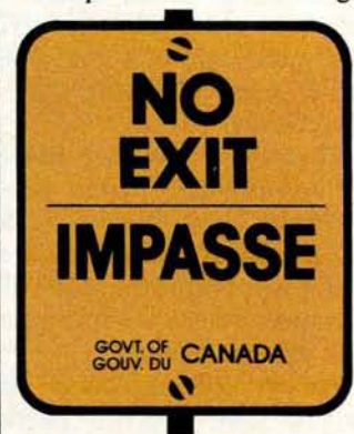
Signs like the one above are common in Canada because the nation has two official languages, English and French. Preaching the Gospel thus becomes more challenging.

offers in French have been traditionally good, whatever literature was offered. Current cost-per-response figures for French booklet ads in magazines run between 98 cents (U.S.) and $4.21 (U.S.) — all very acceptable costs.