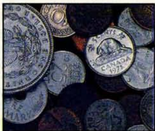
The Work's financial picture in Canada looks good.

The year closed with a 14 percent increase over 1978, with several individual months showing a 20 percent jump in income over the same month in the previous year. Expenses were down on the projected budget as well, and all these factors combined to produce a picture of financial health.