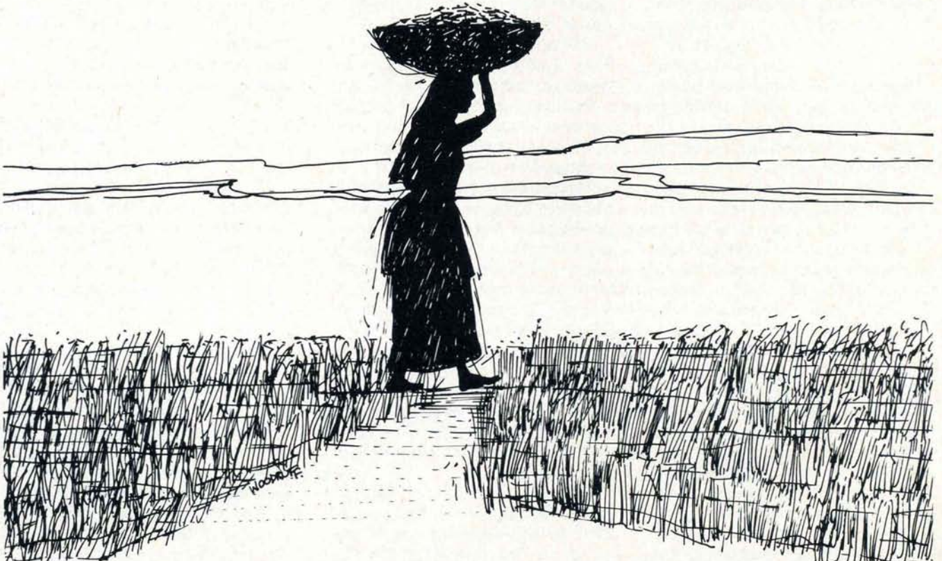
Illustration by Mike Woodruff