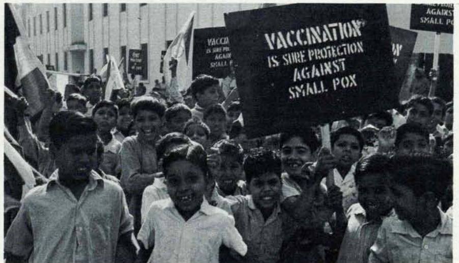
OMS

demic, working hand in glove with war and famine, will lay the groundwork for perhaps the greatest catastrophe ever to confront the human race. In Revelation 6:8, John writes: "And I saw, and behold, a pale horse, and its rider's name was Death, and Hades [the grave] followed him; and they were given power over a fourth of the earth, to kill with sword and with famine and with pestilence and by wild beasts of