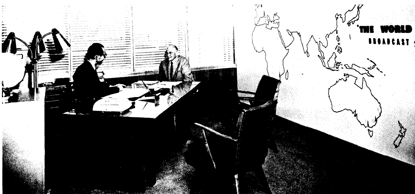
Ambassador College Photos