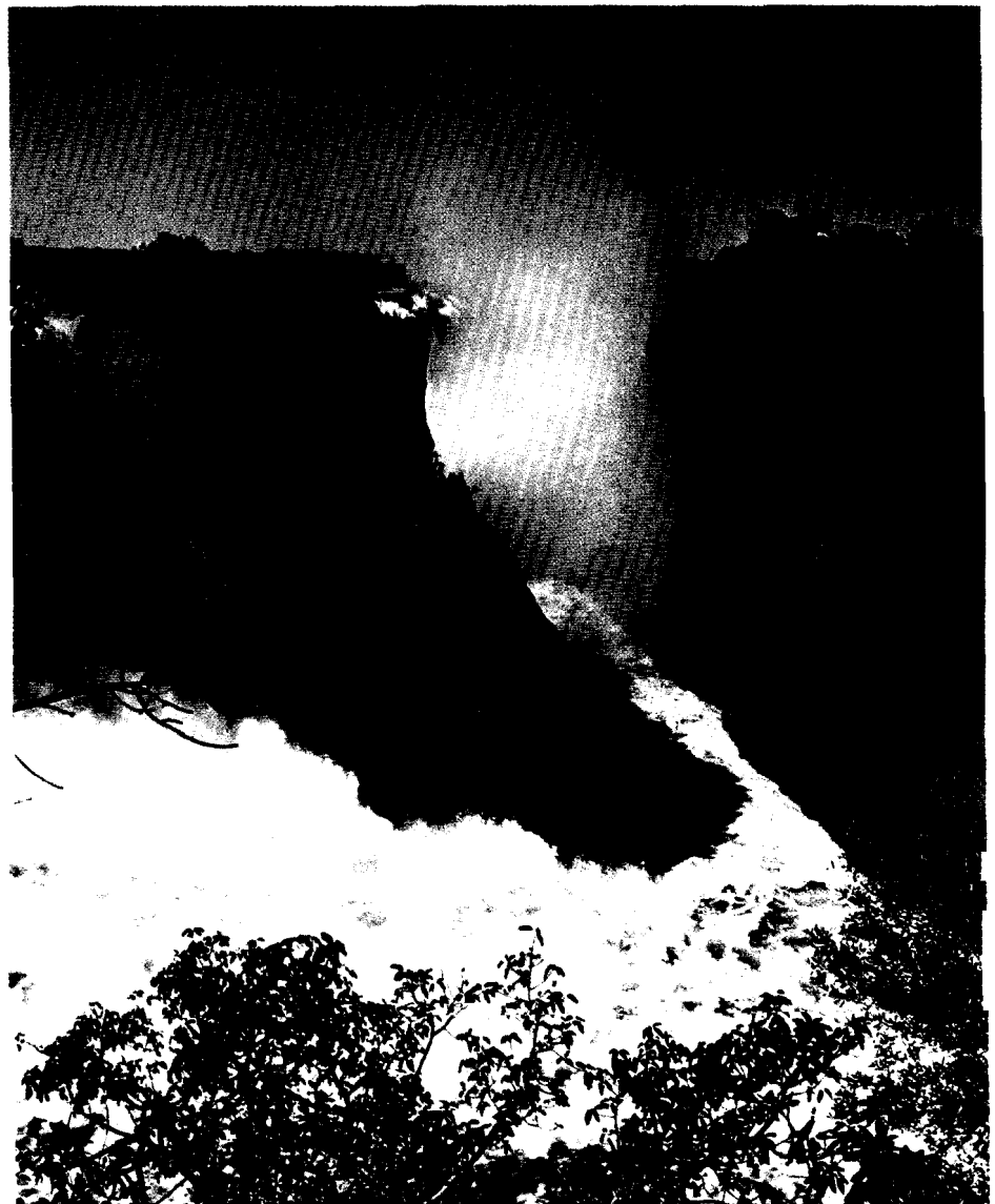
Kilburn — Ambassador College

The facilities were modern and no different from those in the States, with perhaps one exception: there were absolutely no loiterers or any undesirables