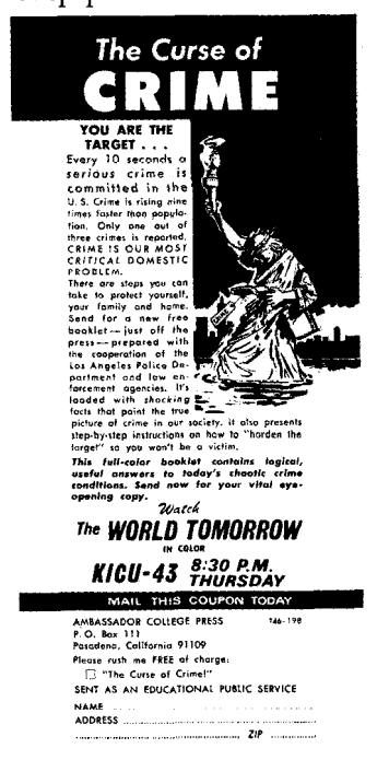
Ad for TV Guide.

TV schedules in the ads. TV Guide with its over twelve million circulation could also become a valuable medium for full-page ads prepared by Mr. Armstrong, along with Reader's Digest and other nationally known magazines and newspapers.