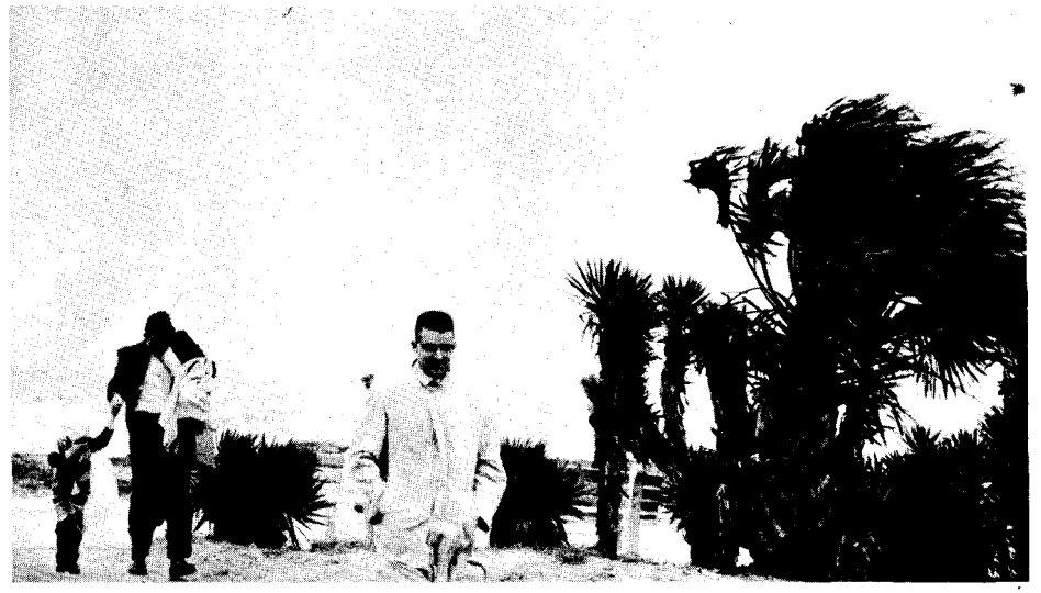
Several brethren brave the strong winds as they make their way back to their room following interruption of services at Jekyll Island last year.

There are also other examples of bad attitudes and disobedience, especially in our newer Feast site, Jekyll Island!