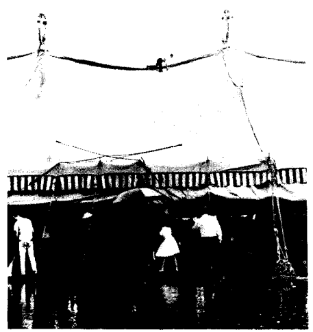
A hearty crew of willing hands heave ho battening down loose ends during a lull in the storm last year at Jekyll Island.

These are only a few of the incidents that occurred at the Feasts in Jekyll Island, Big Sandy and Squaw Valley. There are many other incidents of similar nature that occurred at Blackheath, Hayling Island, Fort-de-France, Merri-