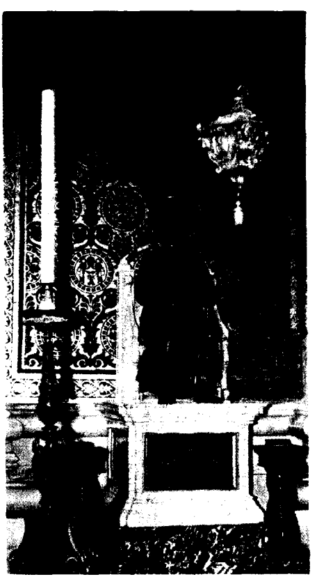
Wolfe Slides, Los Angeles

This much-revered black statue—claimed to be Peter, the Apostle—sits in the splendor of St. Peter's Basilica, its toe nearly worn away by the lips of ardent worshippers. In reality this idol represents Jupiter Olympus!