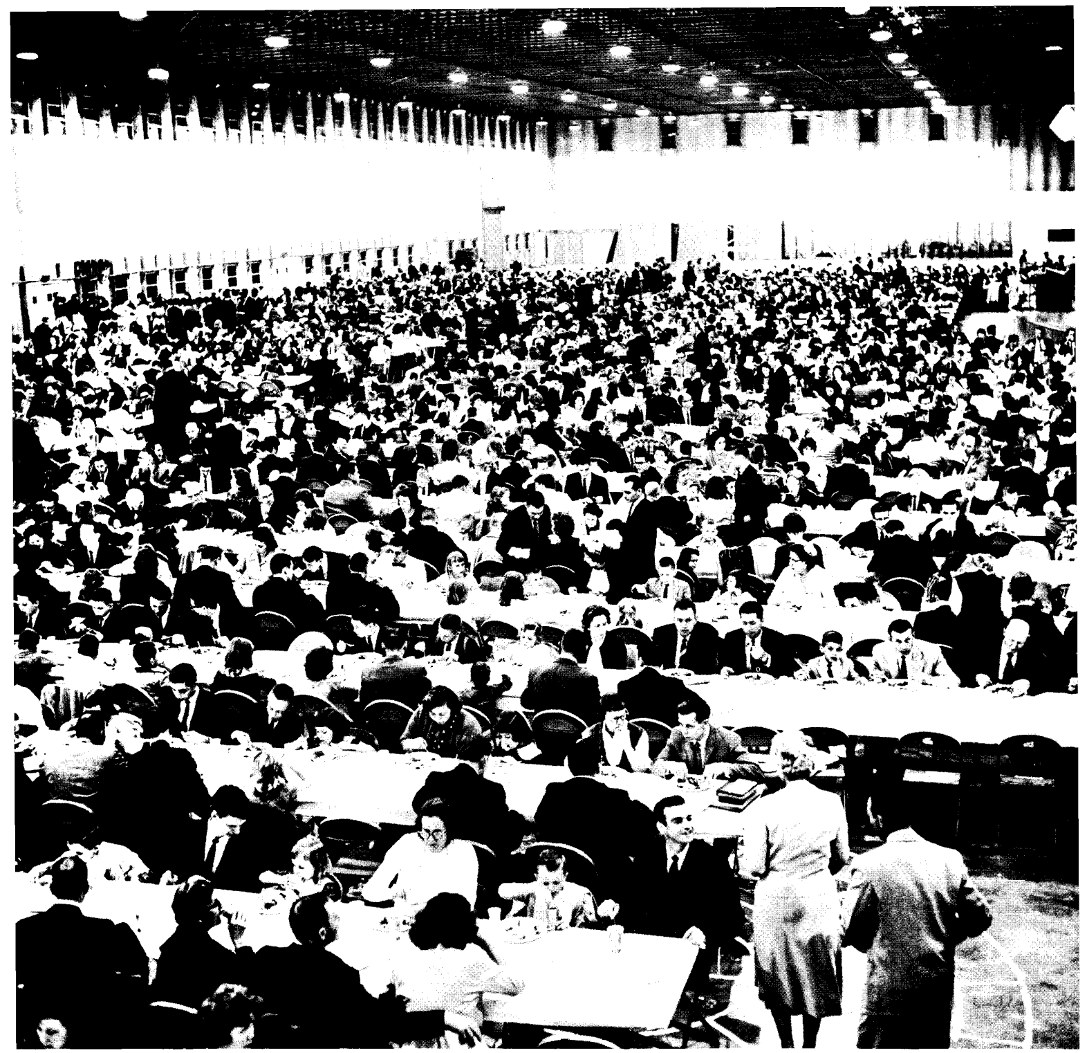
In the Big Sandy Tabernacle, everyone got a foretaste of the huge dining-room-to-be for 1965!