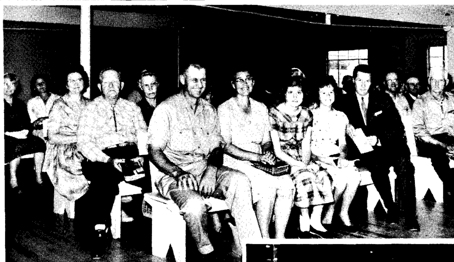
Upper Left: Newly established Bible study at Omaha, Nebraska. Center: Another Bible study recently begun at Rapid City, South Dakota. Lower Right: New church at Boise, Idaho.

"Looking back to our beginning in Kansas City two years ago we had 112