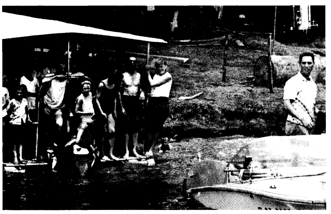
The Summer Educational Program in full swing! The children of many of God's People have the privilege to enjoy the time of their lives—as well as develop character this summer.

Perhaps the single most important activity in God's Work has been carried on behind the scenes. That activ-