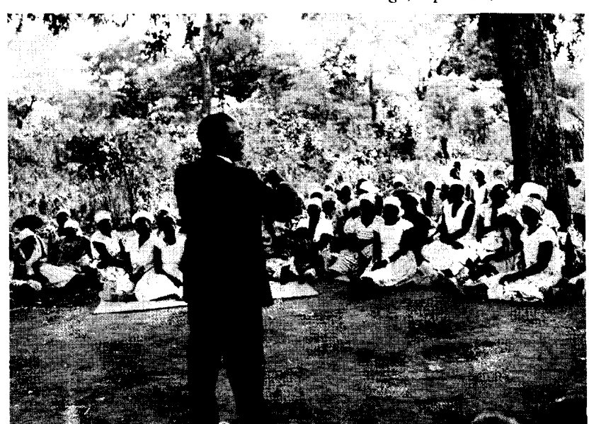
Service conducted at Kasenga's Village on May 7.