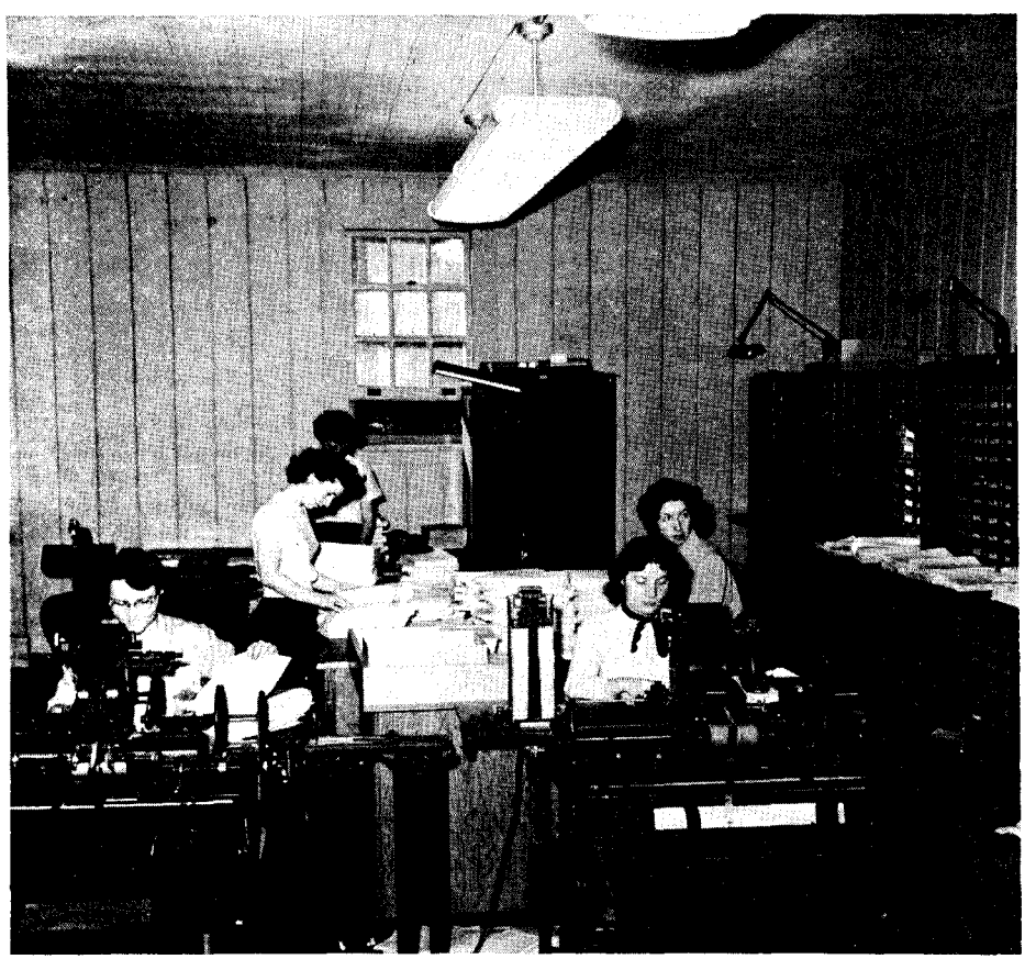
Ambassador College Press Mailing Department as it was in the years of 1948 through 1956.

keeps abreast of Church activity and progress.