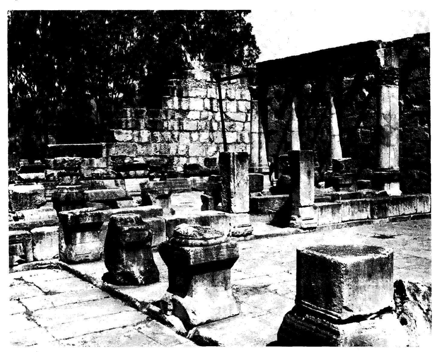
An inside view of the Capernaum synagogue. Though small, this was one of the largest synagogues in all Palestine.